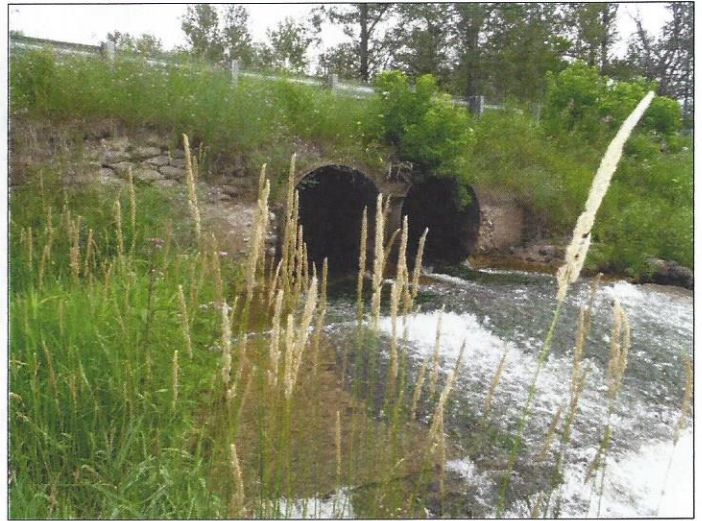
Before - The inadequate twin culverts impeded fish passage and roadbed runoff contributed excessive sediment to the stream