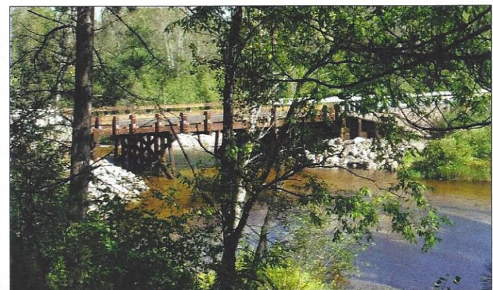
After – Guardrails and paving finished off the new bridge completed in September 2015