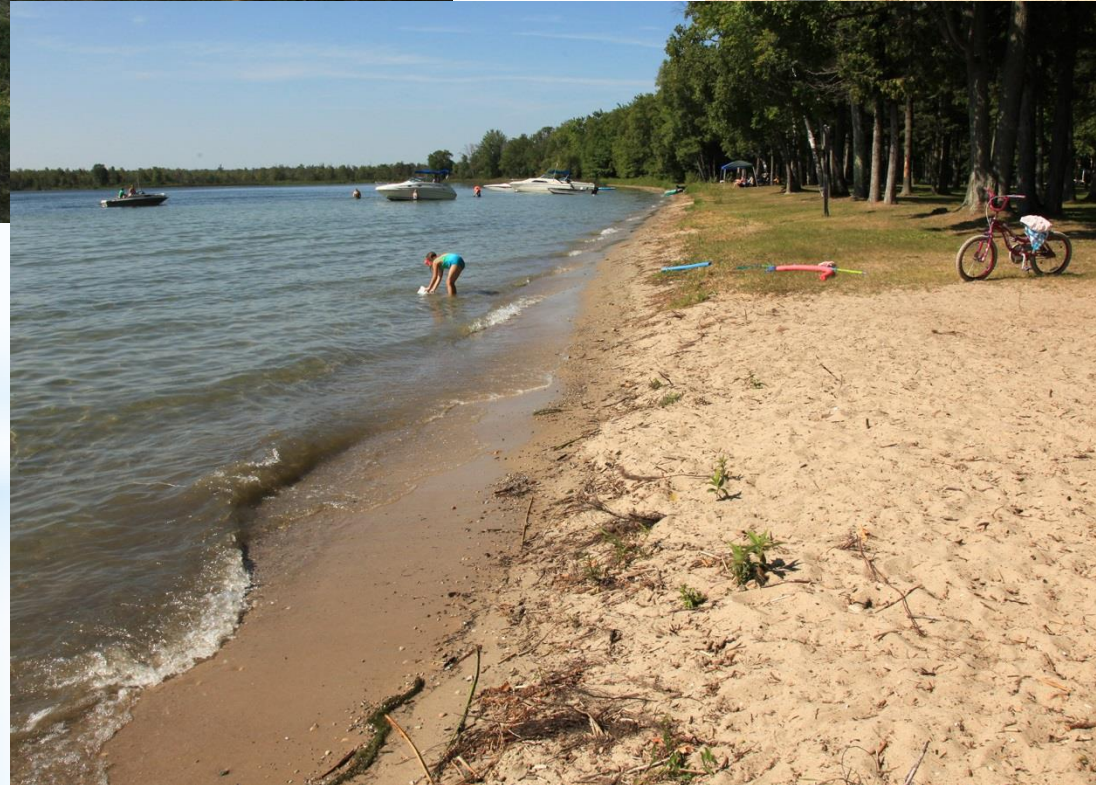
Maple Bay on Burt Lake DNR site

This is a large facility for a large lake with camping, beach, double wide boat ramp and 38 parking spots.