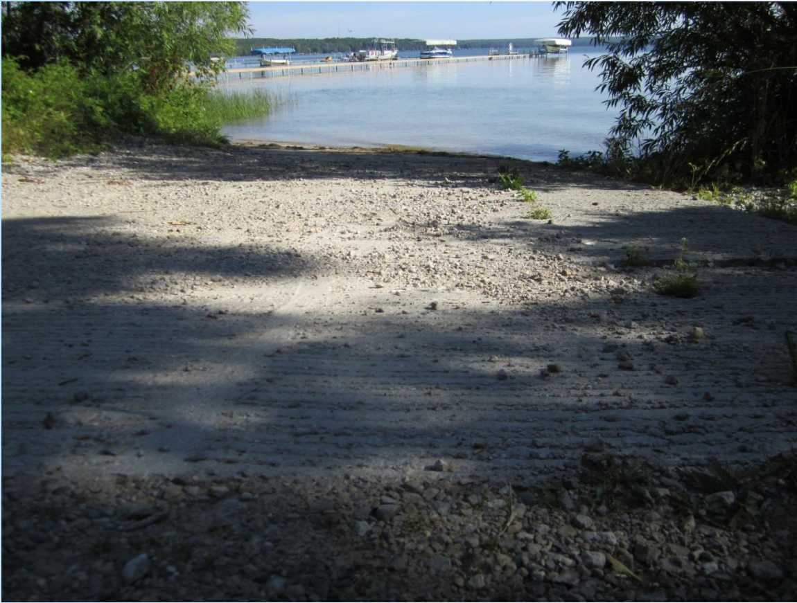
Burt Lake - Mundt Road road end