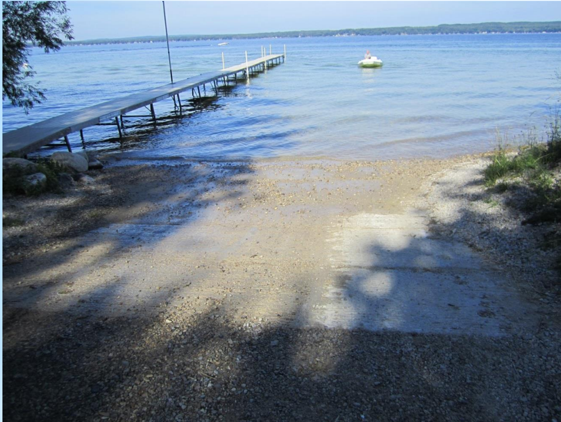
Burt Lake - Hoppies road end