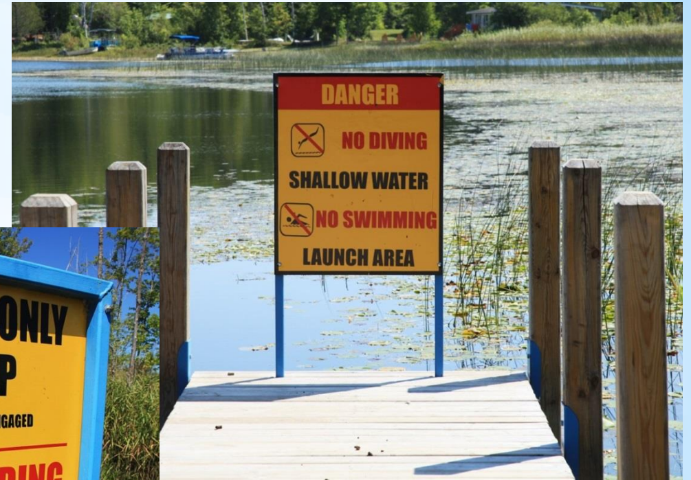
Signage at Lancaster Lake