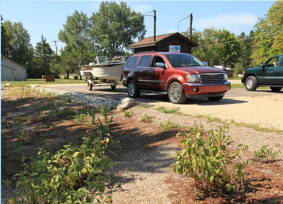
DNR boat ramp at Paradise Lake